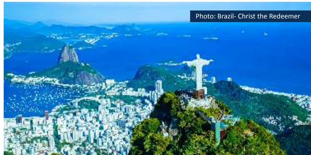
Photo: Brazil- Christ the Redeemer

The pandemic has meant that short term people placements in 2020 were unable to take place. The Journey with Us spring preparation course planned for six candidates scheduled to travel in 2020 was sadly cancelled. Fortunately, two volunteers already in placements returned safely in haste from Dodoma and Banjul. In August USPG hosted a webinar exploring the place of 21st century mission personnel programmes. 49 people participated including one third