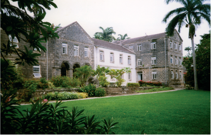
Codrington College, Barbados, the site where SPG once owned a slave plantation

life on earth as a colonised and oppressed Jew. i.e. Jesus' humanity, concrete life, example and his identity (Jewish in the first century and Black now) become the basis for a new form of concrete reconciliation.