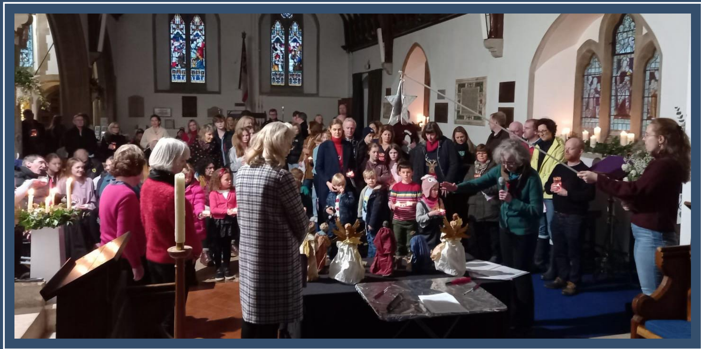
All Saints Church Crib Service Christmas 2022