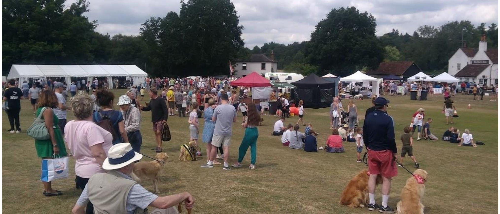
A Mid-Summer's Day at our Annual Village Fete