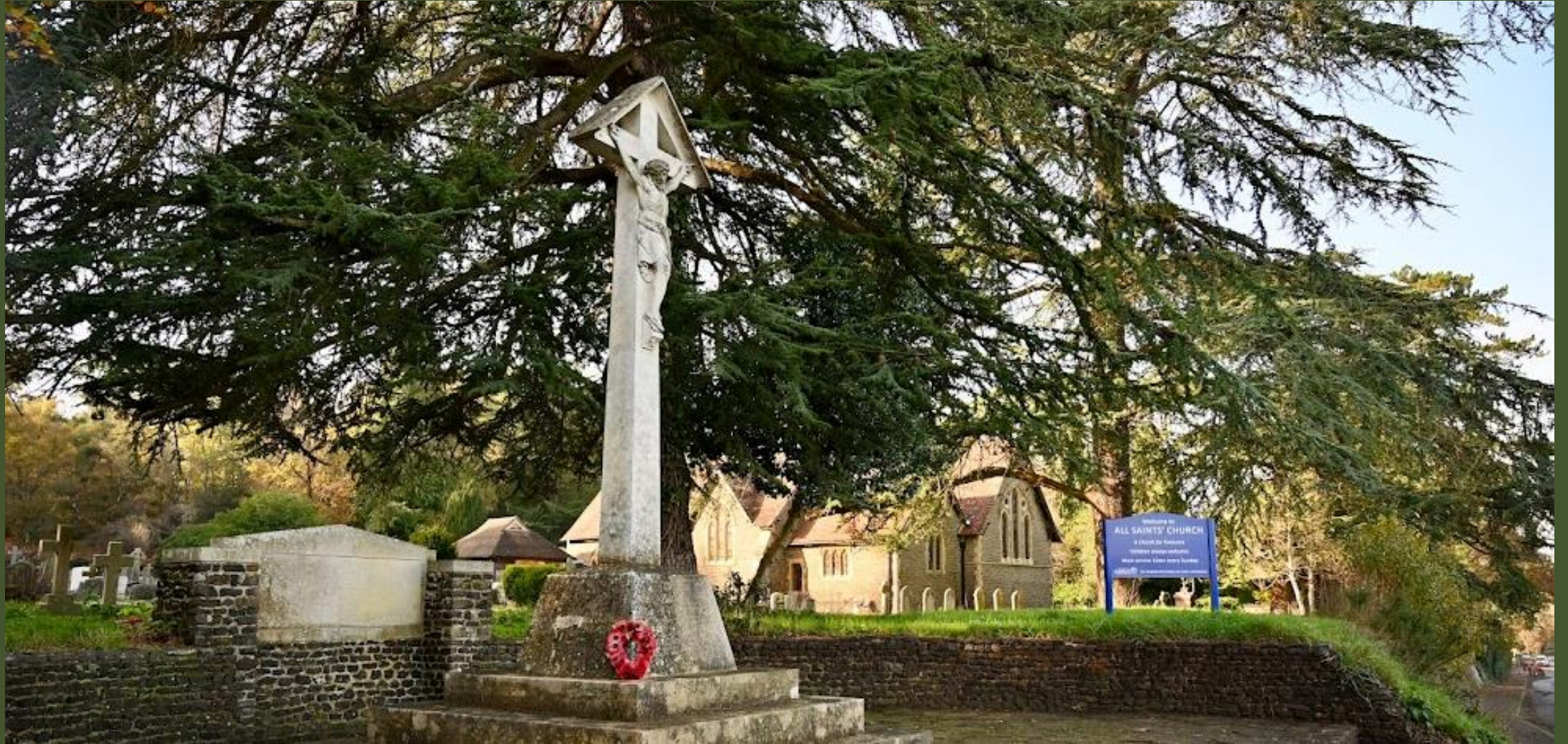
Tilford All Saints Church House for Duty Parish Profile