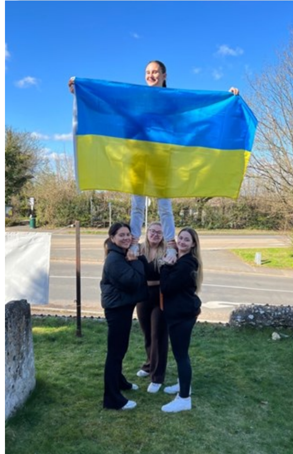
University of Surrey Cheerleading team brought donations every week