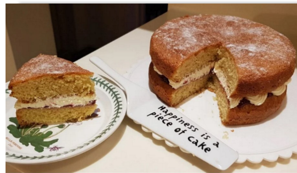
St John's Bakeoff!