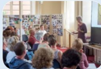
Residential (Fri-Sat) Module Weekends