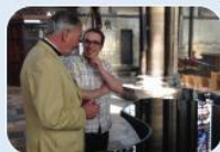
Training Supervisor & Context