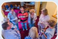
Local Learning Group

Personal learning is supported in three ways.