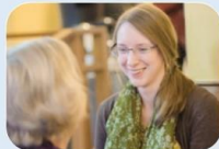
Sarum staff support

Learning in community happens when you come to Sarum College for a residential weekend once during a module. We begin with evensong in the Cathedral at 5.30pm on Friday, and you stay through to 6pm on Saturday. In the first year there are two introductory days as well.