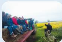
Residential Rural Weekend

Learning in context is primarily in your home church.