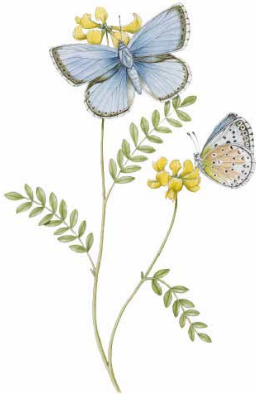
Chalkhill Blue Butterfly