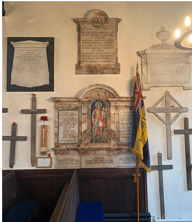
St Mary's Church 1

We want to work with our Rector to promote the Church as contributing to a sense of warmth, inclusion and community.