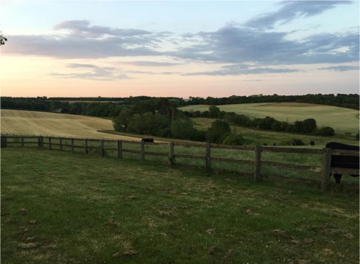
Looking across the Glyme Valley