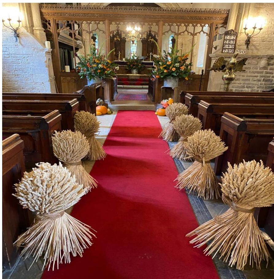
Harvest Festival, St Nicholas

By broadening our approach to worship we have engaged with more people – we would seek to continue this engagement and to explore other outreach with our new Rector.