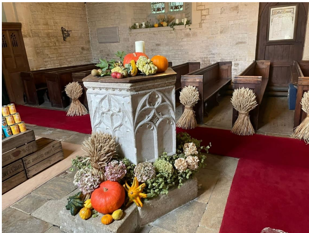
St Nicholas, Kiddington

The PCC will support the new Rector in focussing on ministry and Mission.