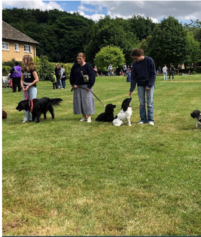
The Dog Show at Glympton Village Fete

The historic parish of Glympton is a small picturesque village of about 25 houses, which was established on its present site when Glympton Park was enclosed in the 17 th Century.