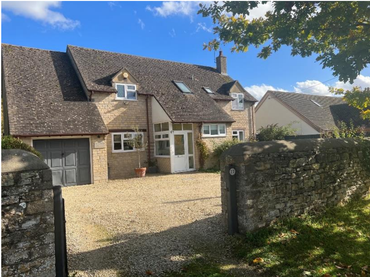
The Rectory, Wootton

The Rectory is in Wootton and is a modern (30 year old) four bedroom detached house, with a sitting/dining room (sliding doors to the rear garden), study, kitchen/breakfast room which has been renewed within the last two years, a utility room and cloakroom on the ground floor. There is a glazed porch and a fine entrance hall with feature wooden balusters and gallery landing. The windows are double glazed. A garage is attached. There is oil central heating. The medium sized enclosed garden incorporates old fruit trees and hedges to the rear while the front is laid to a gravel drive and borders. It is centrally situated, less than five minutes' walk from Wootton Church.