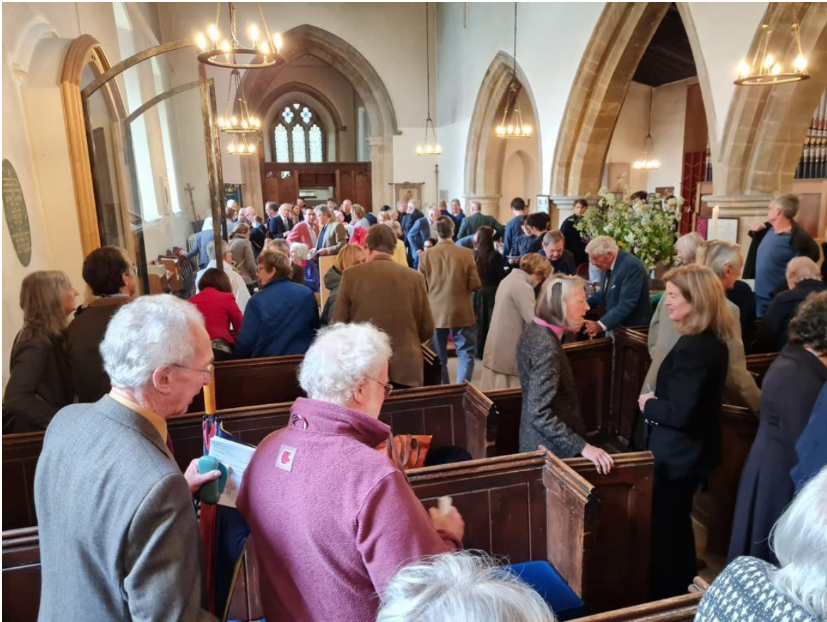
St Mary's Church Wootton