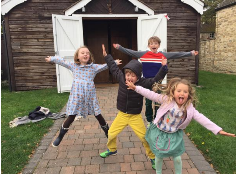
Some young parishioners outside Wootton Village Hall

Wootton is 10 miles from Oxford, just off the A44 Oxford to Stratford road and 2 miles from Woodstock. It is in the 'accessible countryside' (within easy reach of trains to London and having a daily bus service to Oxford), yet remains remarkably unspoilt and is surrounded by farmland.