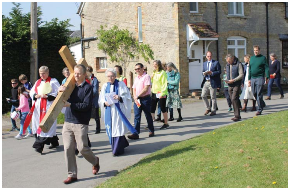
Good Friday procession in Oddington