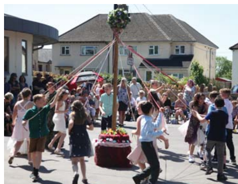
May Day at Dr South's, Islip

Historically, there has been extensive clergy involvement in all three primary schools, which is hoped will continue.