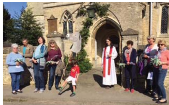
Charlton-on-Otmoor's Palm Sunday celebration

The proximity of the M40 (to London and Birmingham), A34 and rail/bus links make the area attractive to commuters. Railway stations at Oxford Parkway, Islip and Bicester mean a journey to London is an hour or less. Across the benefice the countryside is a patchwork of busy farms, clustered within and around the popular RSPB reserve on the historic moorland of Otmoor with its 'Big Sky feel'. The Army garrisons around Arncott and Ambrosden add an important layer of social diversity as does Bullingdon Prison, less obviously, at Arncott.