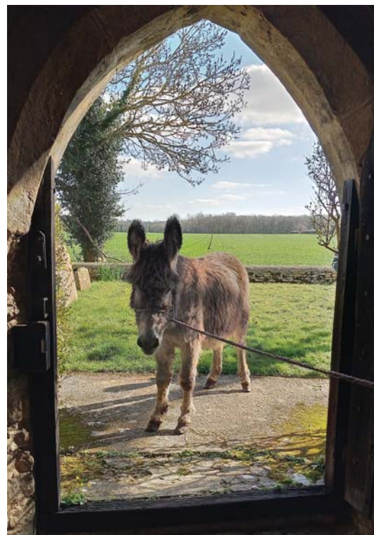
Pet blessing service at Noke

A church near you https://www.achurchnearyou.com/church/5956/ 3 Parishes Magazine 11 issues per year with Islip and Woodeaton (330 print run) Village email group The Church Explorer https://thechurchexplorer.blogspot.com/2021/05/st-giles-noke.html