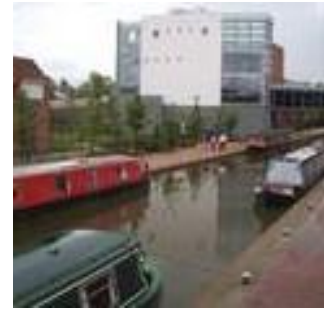
New canalside museum