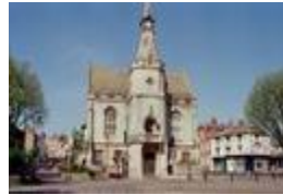
Banbury Town Hall