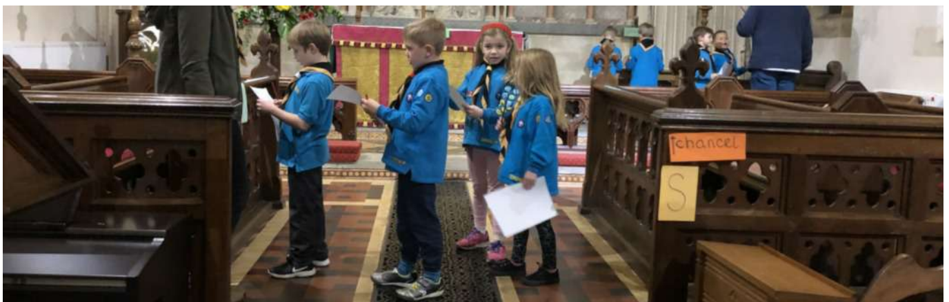
Beavers learning about the church at All Saints, Swallowfield

Details of all the schools that serve the Benefice may be obtained from their websites, links to which are included in Appendix 2: Schools in and around the Benefice .