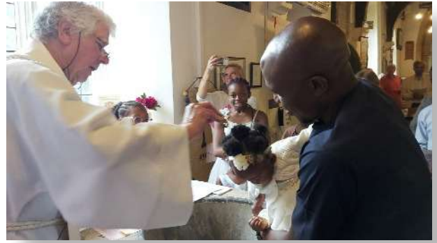
Baptism at Shinfield

Prior to the pandemic there were a number of lively activities across the Benefice, these included: monthly afternoon Tea Service (Messy Church style); a weekly Babes, Mums and Toddler club; a weekly 'Songtime' for a similar clientele; an occasional Saturday morning Dads and Kids club; and a Church Club held after school at the Shinfield Junior school. Post lockdown during Sunday services children are encouraged to take part in services and to complete craft activities at the back of the church. Clergy and laity regularly visit schools to take assembly. Most of these ventures will be open to all across the Benefice.