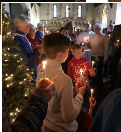
Christingle at Swallowfield