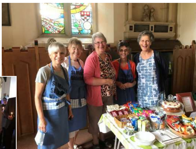
Shinfield's post-lockdown Gateway Café