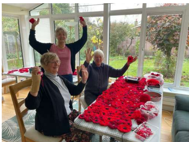
Poppies for the Swallowfield War Memorial