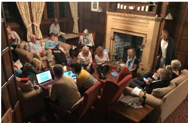
An evening at Shepherds Dene

There are active uniformed groups across the Benefice with varying degrees of contact. They usually attend the Remembrance Day parades.