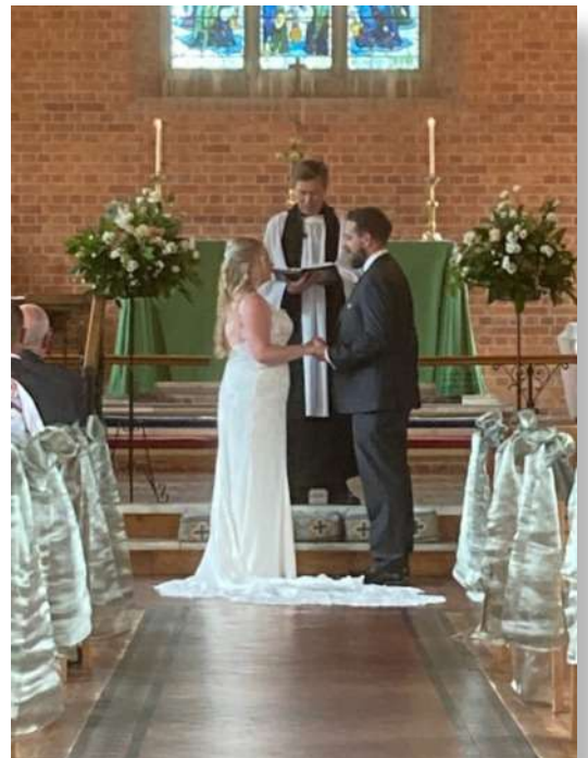
Wedding at Spencers Wood