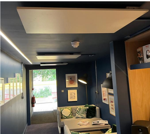
Ceiling Mounted Panel Heaters

The units give out heat from the panel to a range of around 3 metres. Therefore, they can be useful when mounted on the ceiling in domestic-sized rooms or on the underside of balconies or galleries.