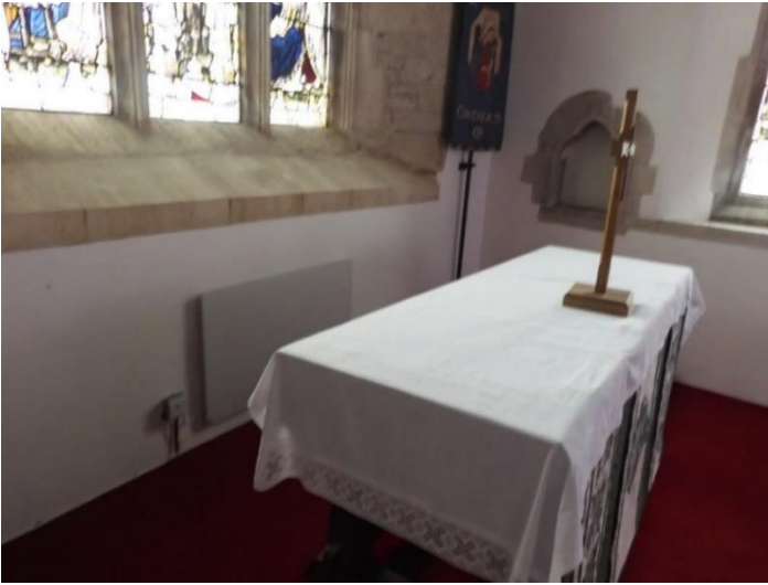
Wall mounted panel heater behind altar

This form of heating is best considered to be a supplementary form of heating. The panels work well providing heating to small areas (WCs, vestries or meeting rooms), or to open areas in conjunction with under pew heating. They can provide a boost function with underfloor heating.