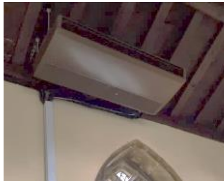
Ceiling mounted unit