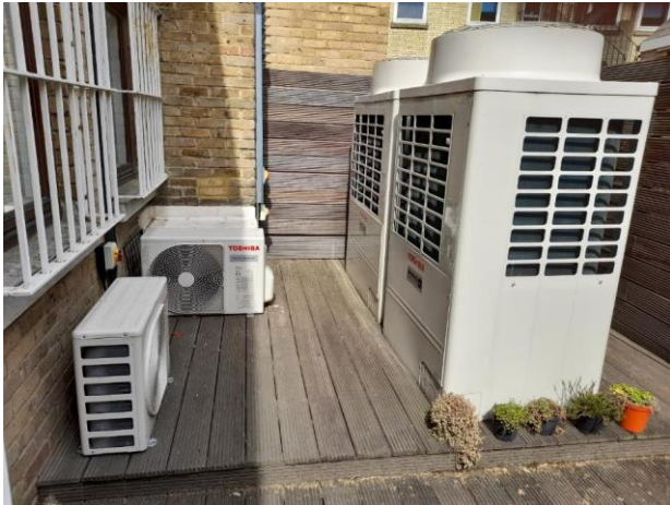
Examples of air source heat pump external units, comprising of three smaller 3kW units and two larger 10kW units.

Summary: Air-to-air heat pumps are well-known and extensively tested in modern buildings, this is an electric system that works like air conditioning but for heating. Suitable for churches with a medium-high usage pattern, and can work in uninsulated buildings if designed and sized correctly.