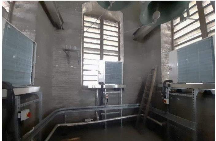
External units install in bell tower at St Andrews in the Wardrobe