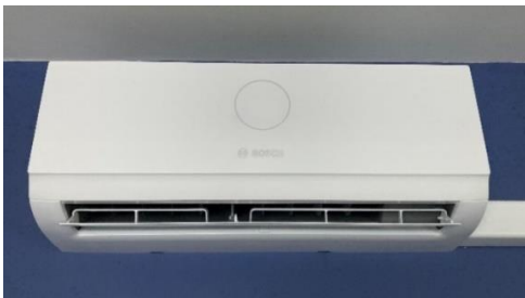
Wall mounted unit for a more modern location