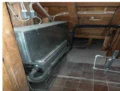
Internal unit installed behind timber panelling at St Andrews in the Wardrobe, City of London