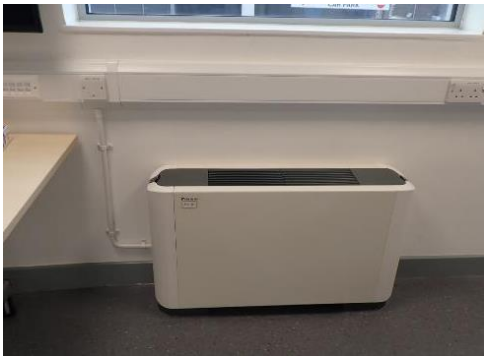
Floor mounted unit

Internal units come in a variety of styles. The most appropriate internal units for the majority of churches are floor-mounted units, which look very similar to a fan convactor heater.