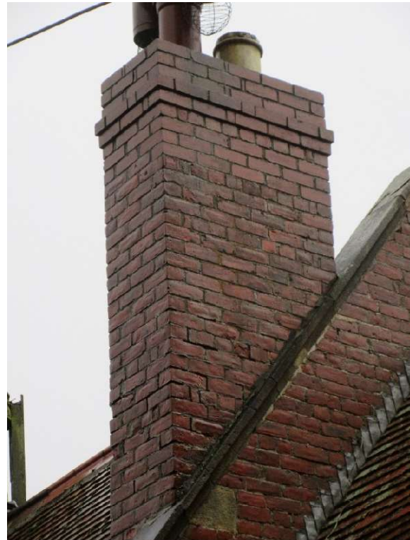
scattered open joints in W side