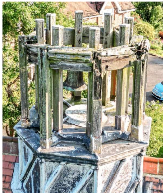
2023 drone photos supplied by the parish