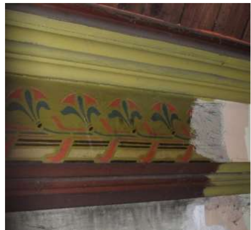
Part of stencilling remaining behind organ