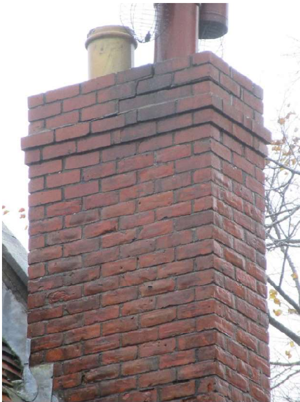
Chimney top courses appear jacked up