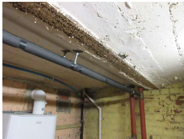
steels at boiler ceiling

48. Boiler room ceiling is vaulted in-situ concrete on two steels whose bottom flanges are rusting.