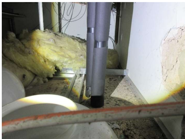
Insulation quilt not relaid over ceiling N of the wc

47. Exposed vertical sarking in church. In Vestry, wc and Porch sound painted plaster with insulation quilt but part of the quilt close to the Nave turned back and not relaid.