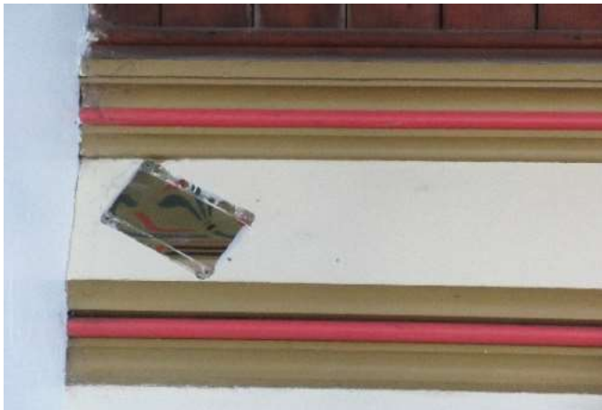
Present frieze colours in chancel with fragment of stencilling