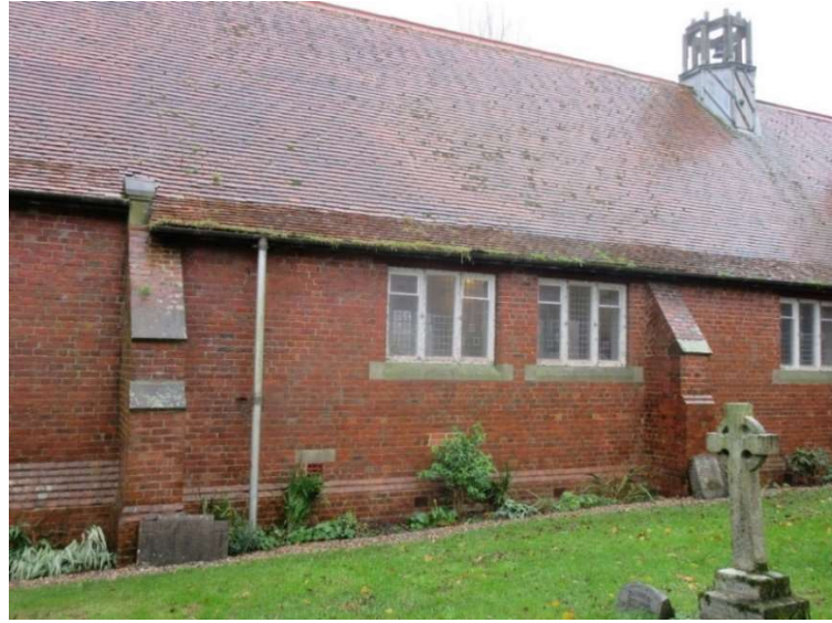
paragraph 27 – N gutters choked