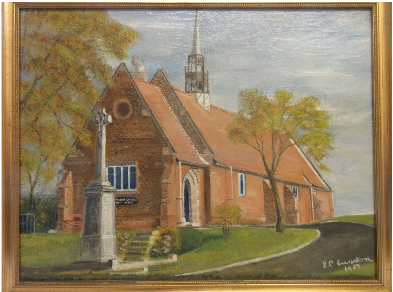
Painting in the Vestry – best illustration of the turret's original form