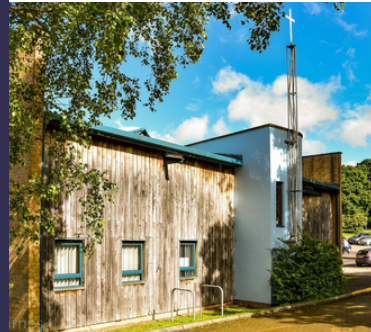
St. Paul's Parkwood