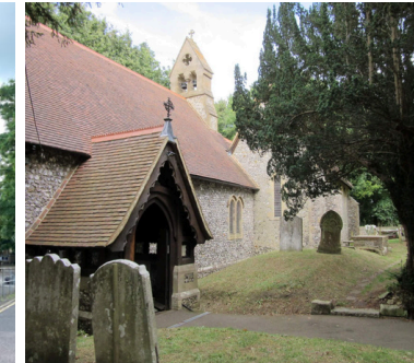
St. Peter's Bredhurst