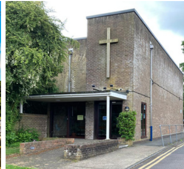
St. Matthew's Wigmore