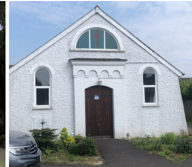
All Saints Hempstead