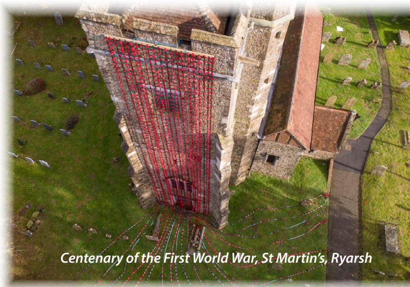
Centenary of the First World War, St Martin's, Ryarsh

Some of our activities, like the Men's Breakfast, are more overtly evangelistic. We are running our first Team-wide Alpha course this autumn.