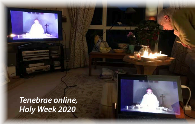
Tenebrae online, Holy Week 2020

During the Pandemic, all of the parishes started to offer online worship and ministry. Currently West Malling and Leybourne continue to provide live-streamed worship every Sunday morning