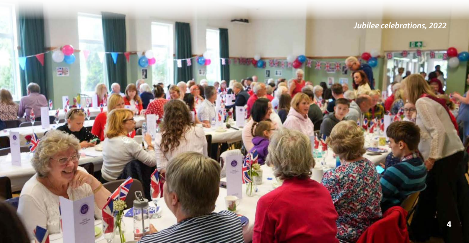
Jubilee celebrations, 2022