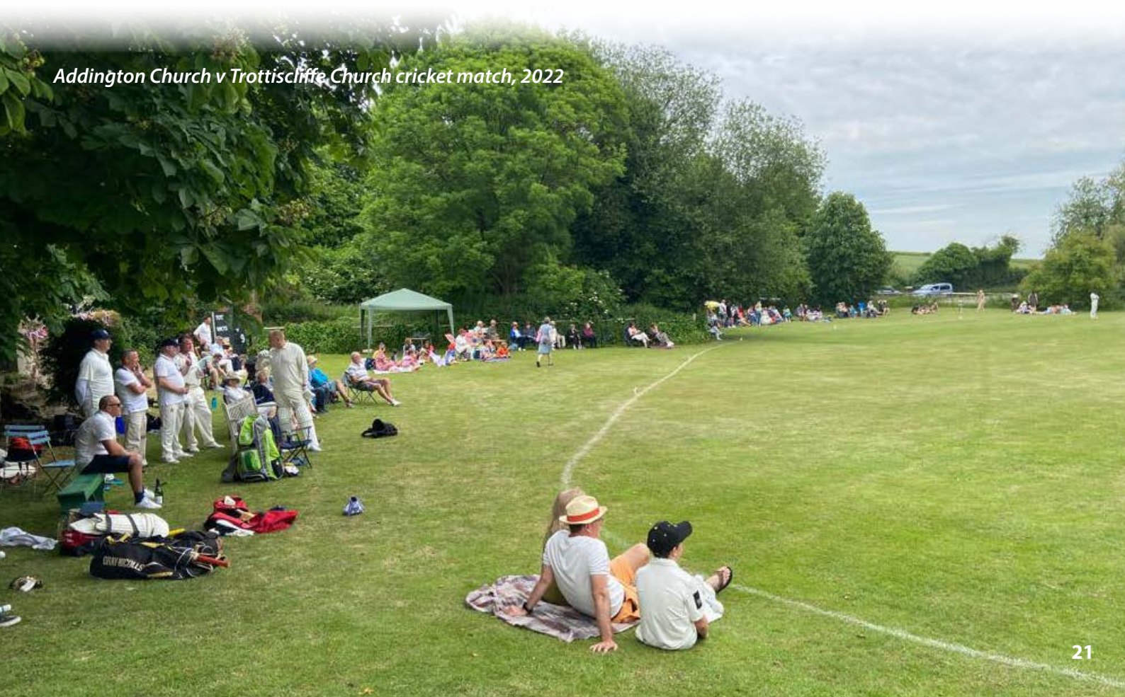
Addington Church v Trottiscliffe Church cricket match, 2022

There is a clear and exciting opportunity for our Team to reach out to the residents of Leybourne Chase together, and the successful candidate will need to be excited about the opportunities and able to lead church and community into an exciting future through community development, community engagement and mission.