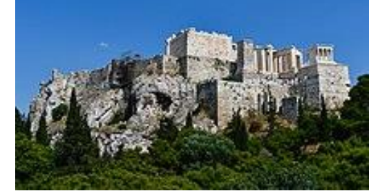
The Acropolis as viewed from the Areopagus

The Areopagus as viewedEngraved plaque containin St Paul'sfrom the AcropolisAreopagus sermon