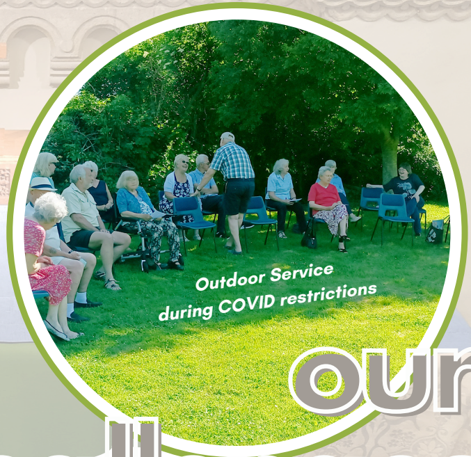
Outdoor Service during COVID restrictions