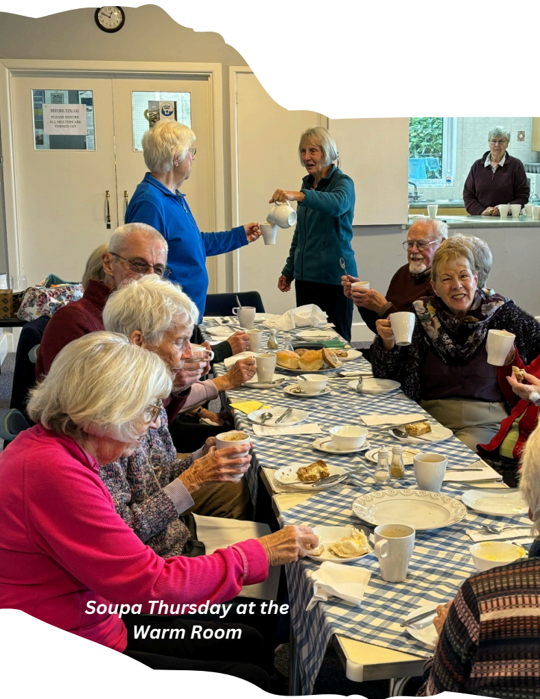
Soupa Thursday at the Warm Room