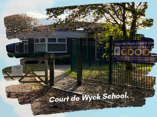
Court de Wyck School.

We try to reach out to members of both villages showing God's love and caring for our community