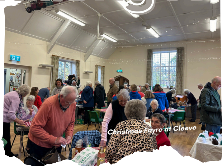
Christmas Fayre at Cleeve