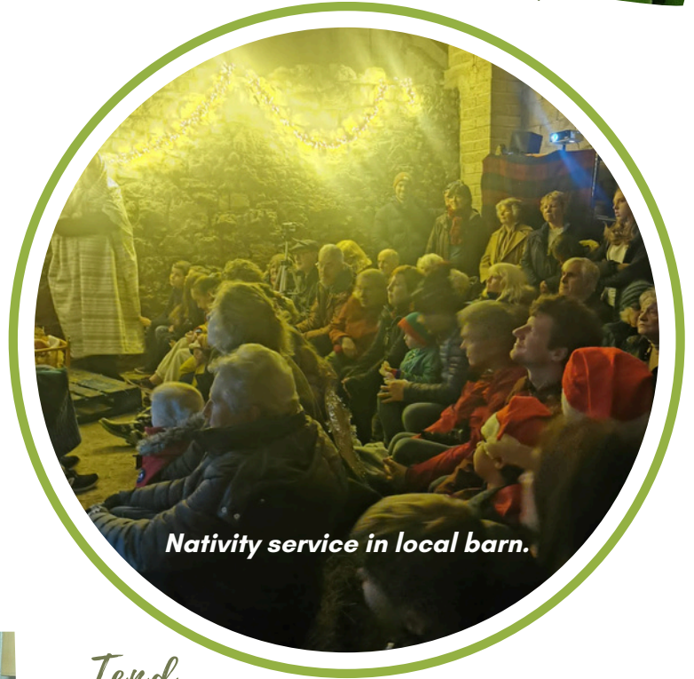
Nativity service in local barn.