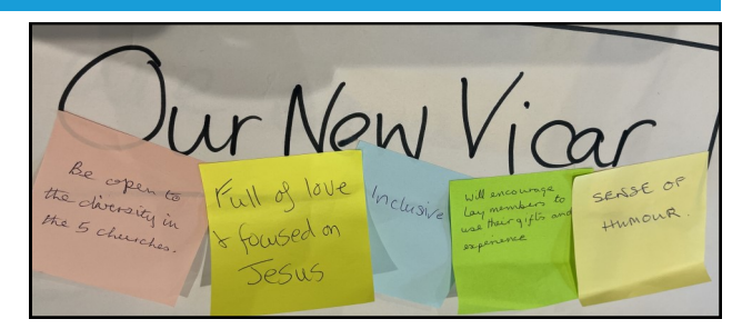
Feedback from our Open Meeting