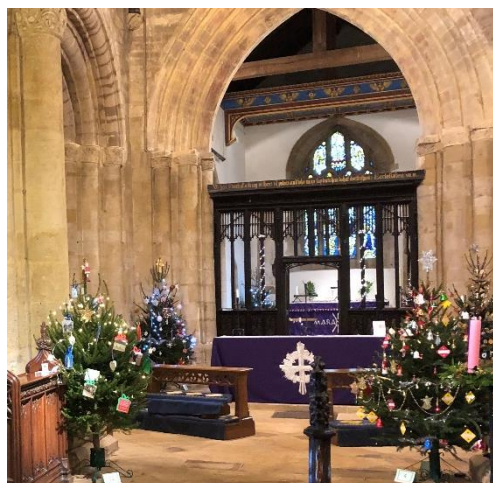
Other Churches in Milborne Port

Fund-raising events are arranged several times a year, including quizzes, talks, concerts and social occasions. In July, the Church Fete attracts a large attendance from the village and surrounding communities and raises a significant sum towards church expenses as well as being a focus for entertainment and meeting friends. Our Annual Gift Day is combined with an Open Day with exhibitions and activities. These hospitable events are always well-supported by the village, as is the Christmas Tree Festival every few years, and really show how the church is still a natural focus for the community at these times as well as in weddings and funerals.