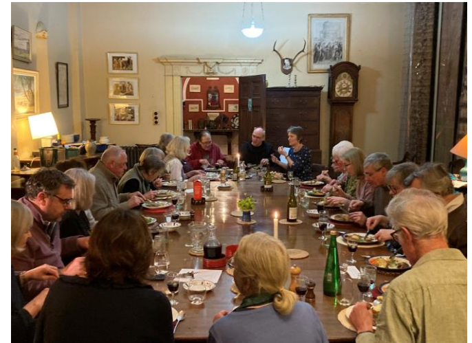
Home Group Passover Supper

These include bellringers and some "Friends" organisations.