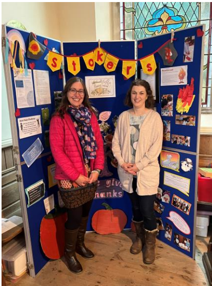
Leaders of the Stokers