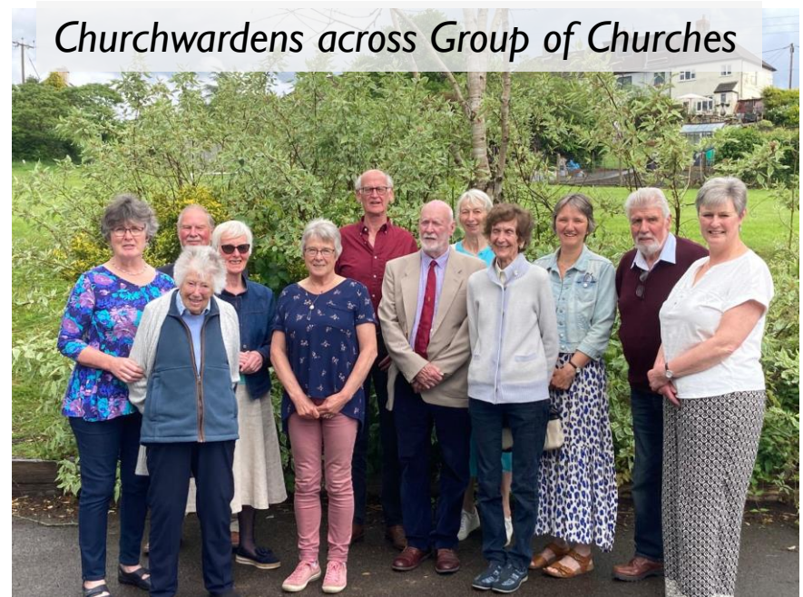
Churchwardens across Group of Churches

We have two Parish Safeguarding Officers covering the three parishes.