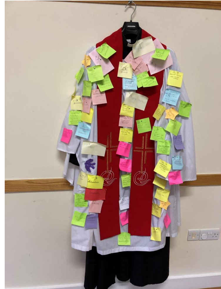
Part of our Consultation Process!