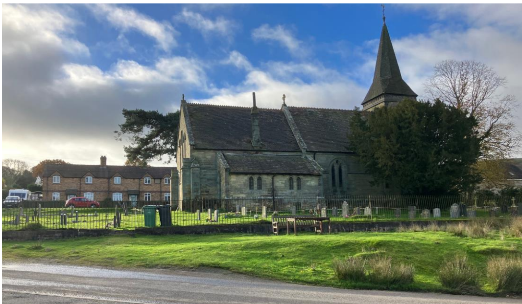
Image: St Mary's Church with the Almshouses behind