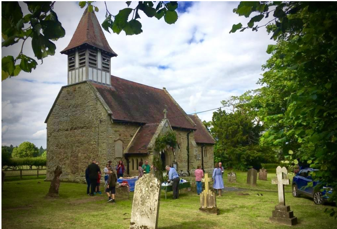
The church is very small, much loved and in reasonably good condition.

Church services, once a month, tend to be quite cosy, usually with no more than half a dozen people, but occasionally more. The church is a focus for people to get together, so even if people are not religious or don't have faith, or have a different faith, they do tend to come along from time to time. The Parish Giving Scheme is well supported.