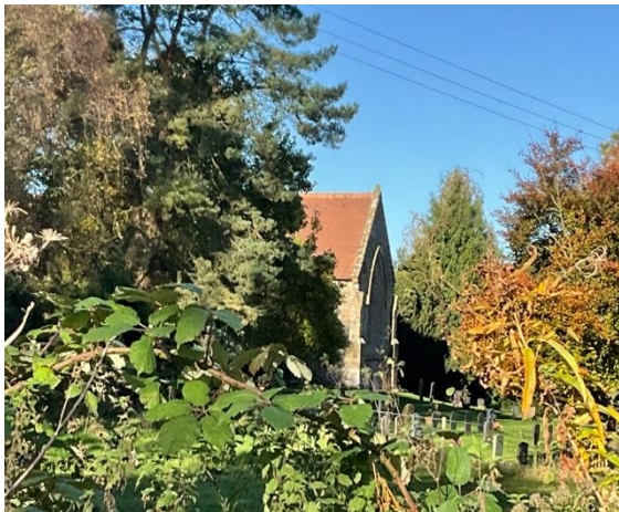
< Chancel from across the rear garden