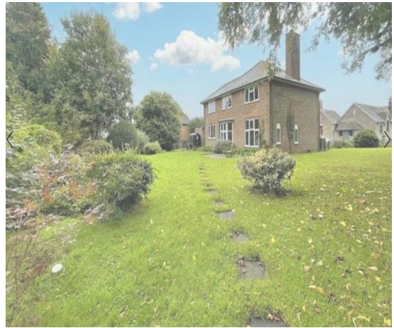
Rear garden with footpath to church