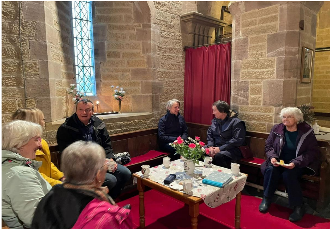
Image: Coffee Morning in our church

St Mary's generally has a congregation of around 4 people; this swells fivefold for our Harvest and Christmas Festival services.