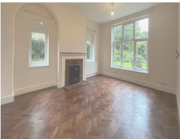
Sitting Room looking to rear garden