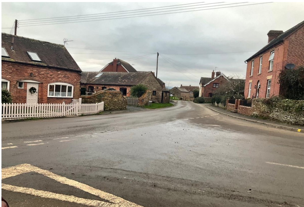
The (Market) Square, Stottesdon looking west

Stottesdon's pre-eminence was thus assured despite the change of king; in 1244 William's distant successor Henry III issued a Royal Charter allowing a weekly Market on Tuesdays (in The Bull Ring and The Square – road names that have long-outlived the market). The nearby church was surely the community meeting place and it's porch-altar a cash settlement point on those market days?