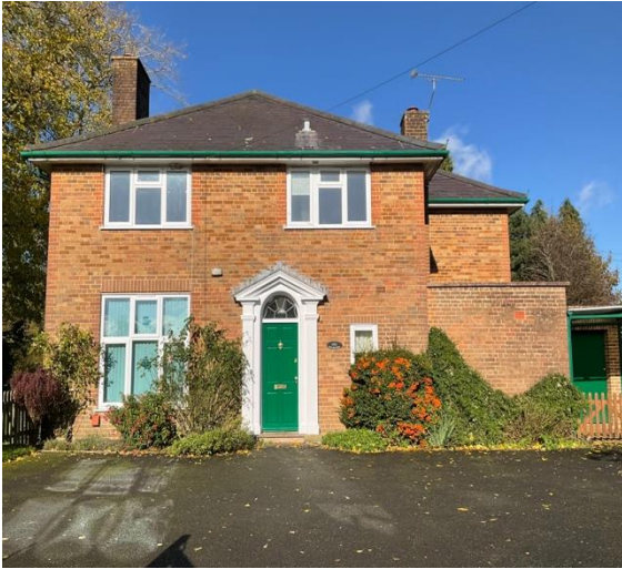
< Road frontage from the School opposite