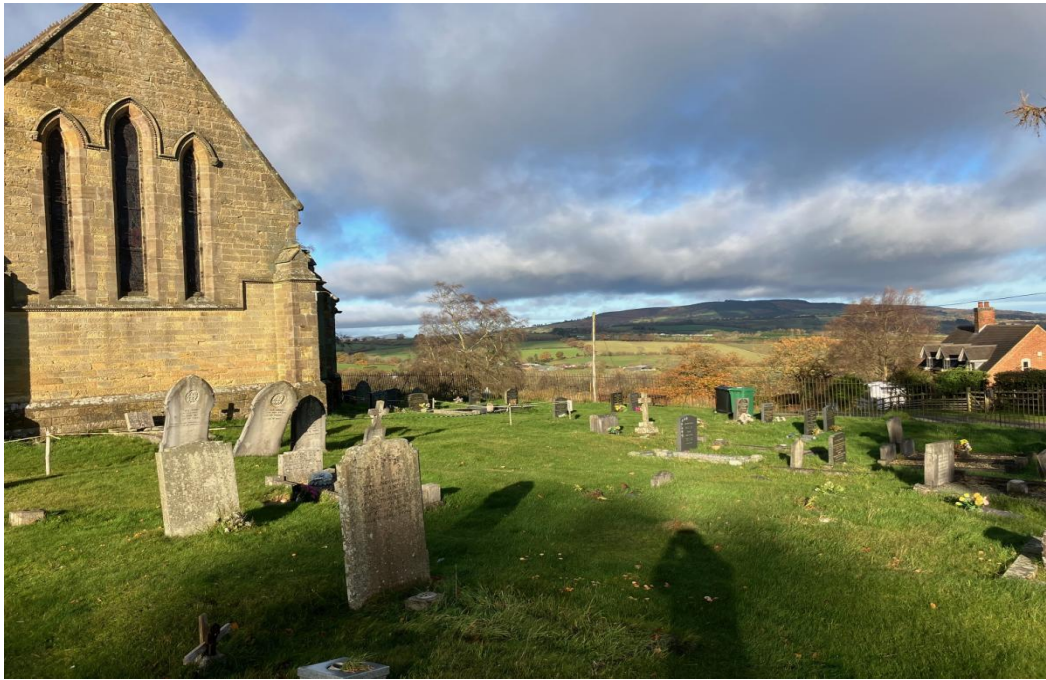
Image: View towards Brown Clee from the churchyard.