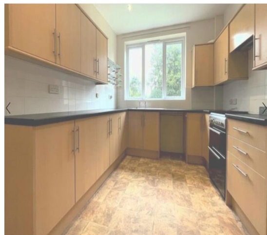
Kitchen looking to rear garden