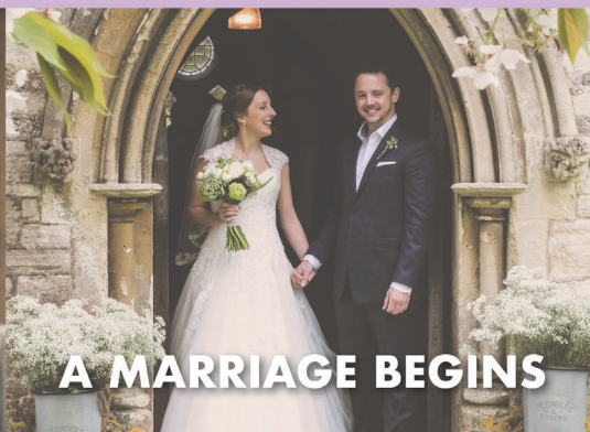
A MARRIAGE BEGINS