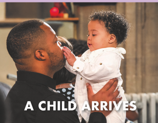
A CHILD ARRIVES

FOR THE DAY. AND ALL THE DAYS TO COME. JUST ASK.