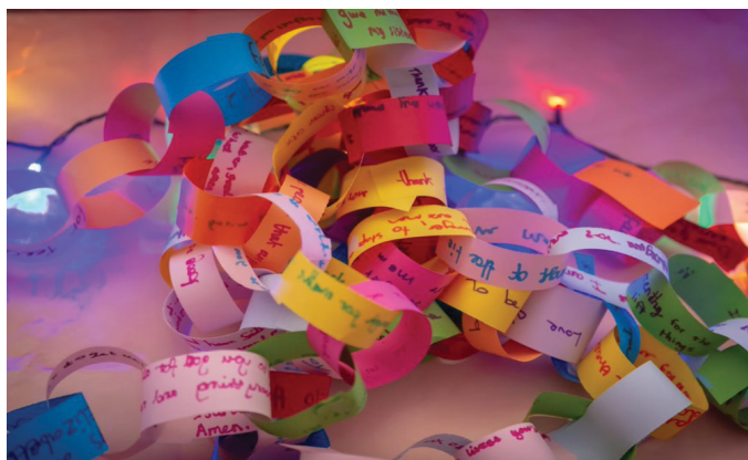
25 metre prayer chain still growing! A prayer chain started at school was added to at church over Easter and is still growing!

"By thinking about the deanery as a whole we can be much more imaginative and bolder".