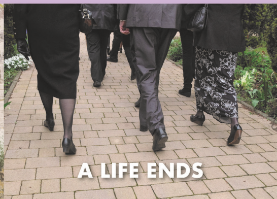
A LIFE ENDS