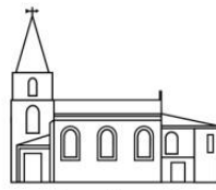
Gosforth Parish Church of St Nicholas