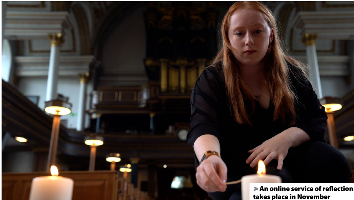
> An online service of reflection takes place in November