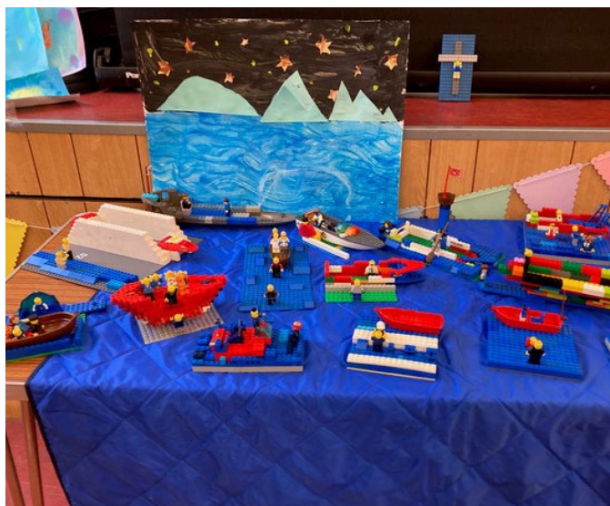
➤ Jesus walks on water in Lego - Matthew 14:27