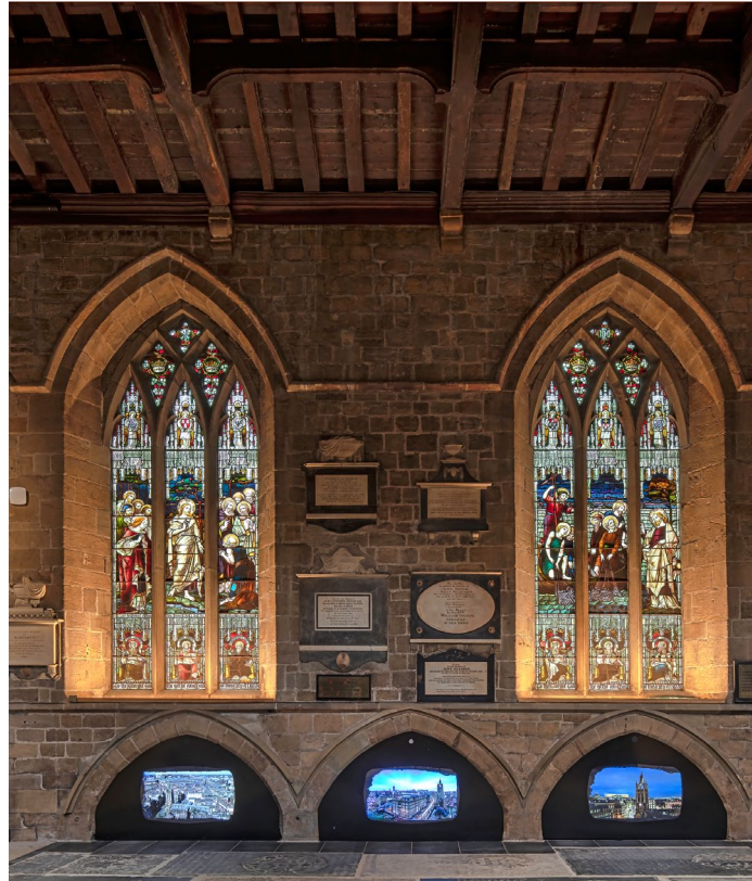
> New features include interpretation panels, lively animation and a new sound and light show.