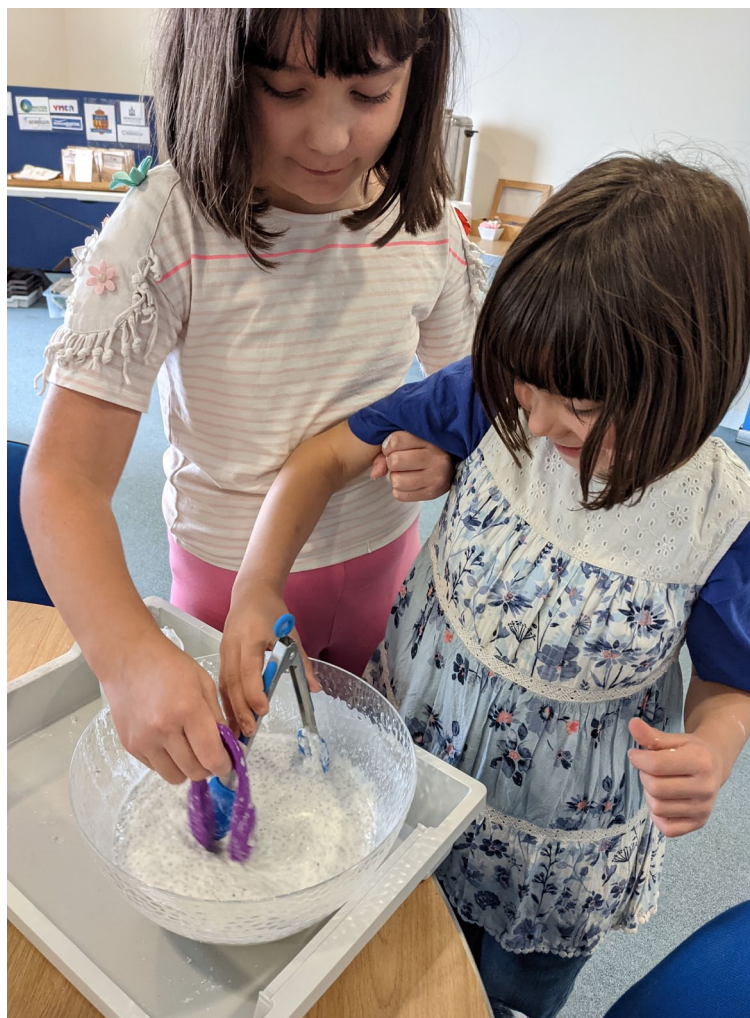
► It was a 'hands-on' day for the children!