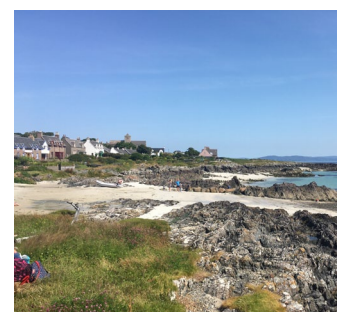
> Iona and Lindisfarne Priory

The decision which should hold sway over Northumbria was made by Oswald after winning the Battle of Heavenfield near Hexham in 634AD, declaring himself to be a Celtic Christian King. After the battle, as he settled into ruling his Kingdom of Northumbria, Oswald sent to Iona for missionaries, for the long years of pagan domination