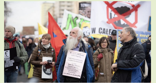
> The pilgrims are walking 1,450km from Poland to Glasgow .