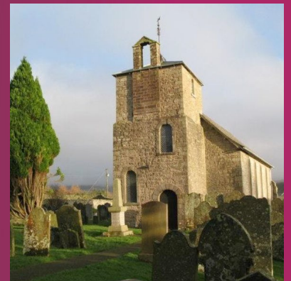
> The mighty St Cuthberts in Corsenside, said to be a former resting place for the coffin of St Cuthbert

We also see St Cuthbert, Corsenside, featured. Rooted in its landscape this is a remarkable little church, isolated but intimate. Open to the elements, offering shelter