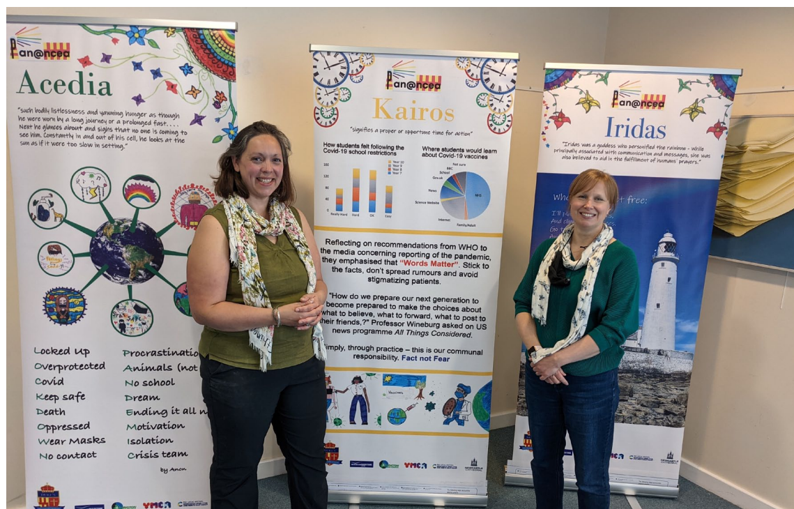
► Academic staff at the church school posing with one of their student's displays