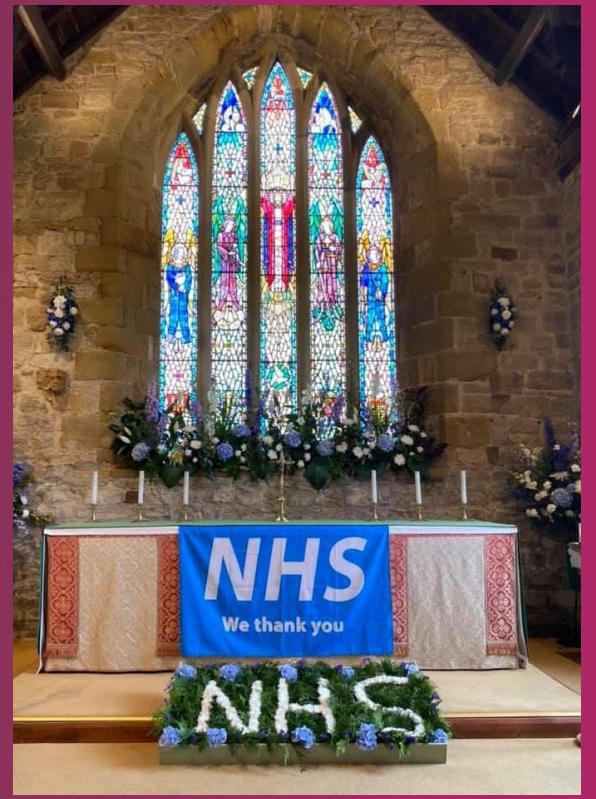
> Festival goers gave thanks for the efforts of the NHS throughout Covid-19.