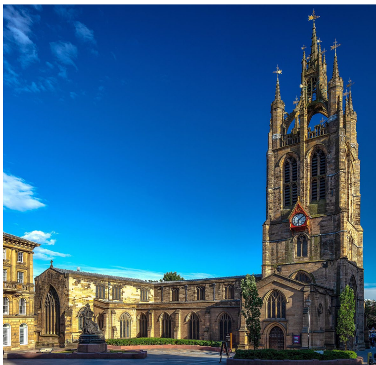
> Café 16 has opened in Newcastle Cathedral

The cathedral café will be supplied with freshly-made produce from Café 16 and its Bakery in HMP Northumberland. Oswinners will gain experience, be supported and mentored, train, and achieve qualifications