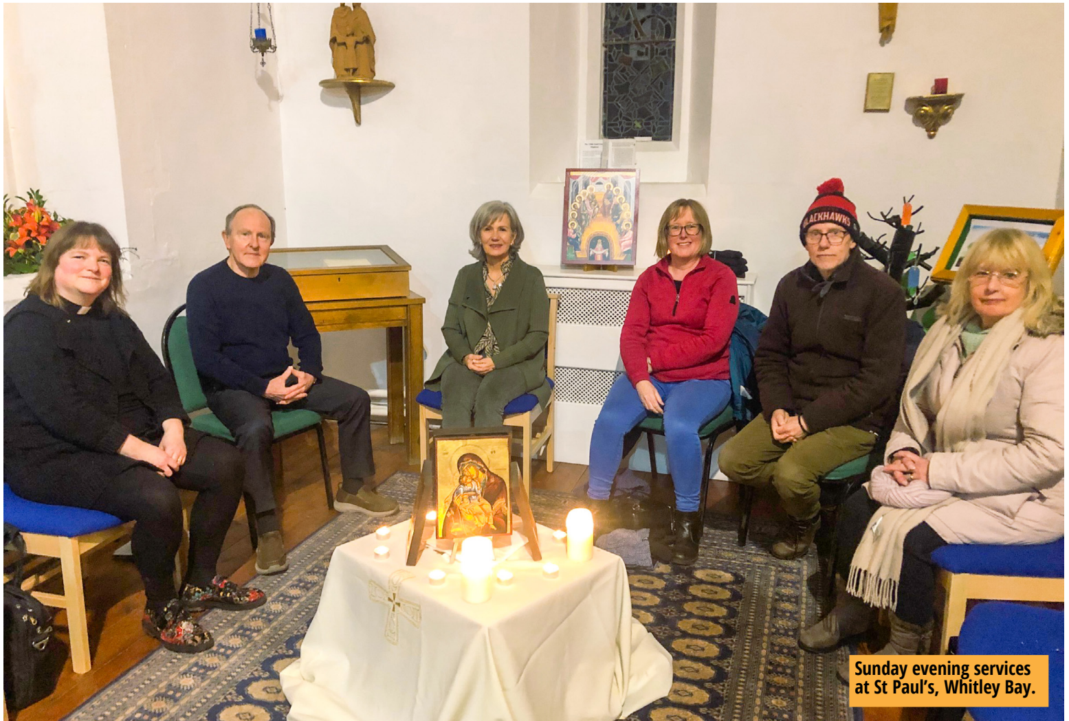
Sunday evening services at St Paul's, Whitley Bay.

A church is reaching out to new audiences after finding success with Sunday evening services. The weekly services have become a popular fixture at St Paul's, Whitley Bay, where they are a welcome addition to traditional Sunday morning eucharists.