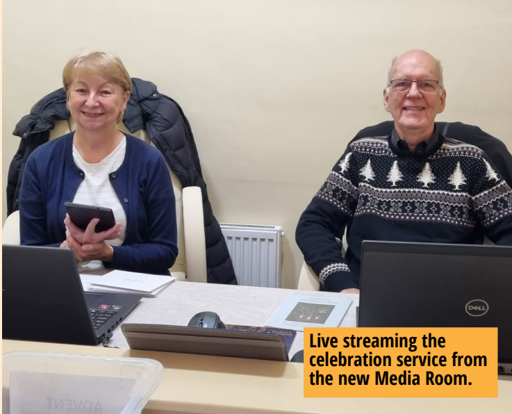
Live streaming the celebration service from the new Media Room.