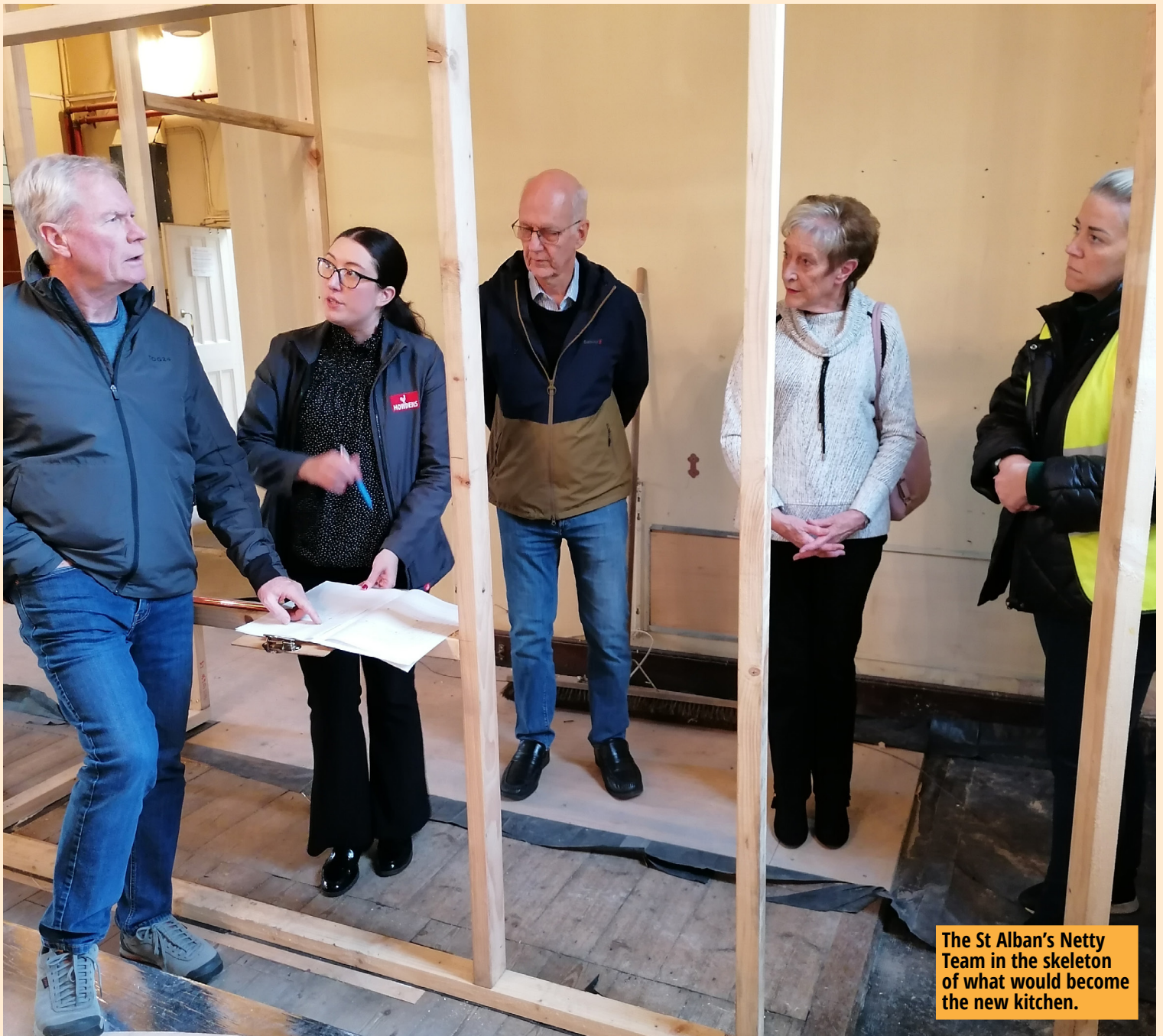
The St Alban's Netty Team in the skeleton of what would become the new kitchen.

A rural church near Whitley Bay has hosted a special celebration to mark the completion of a five-year project to provide new facilities.