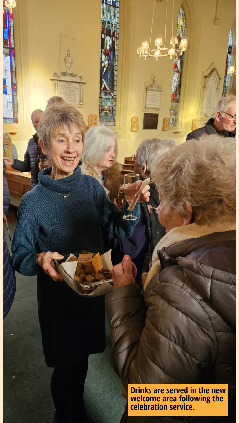
Drinks are served in the new welcome area following the celebration service.