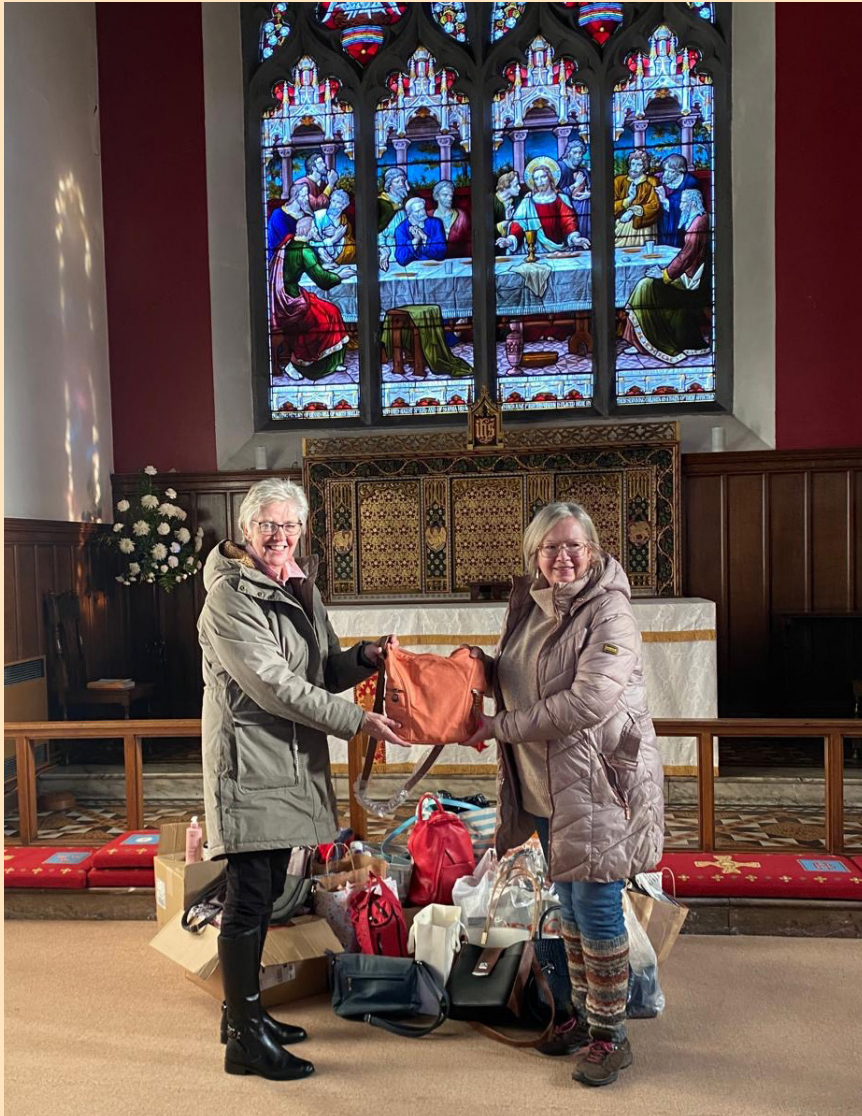
Pages 6&7: Bishop's Christmas Appeal.