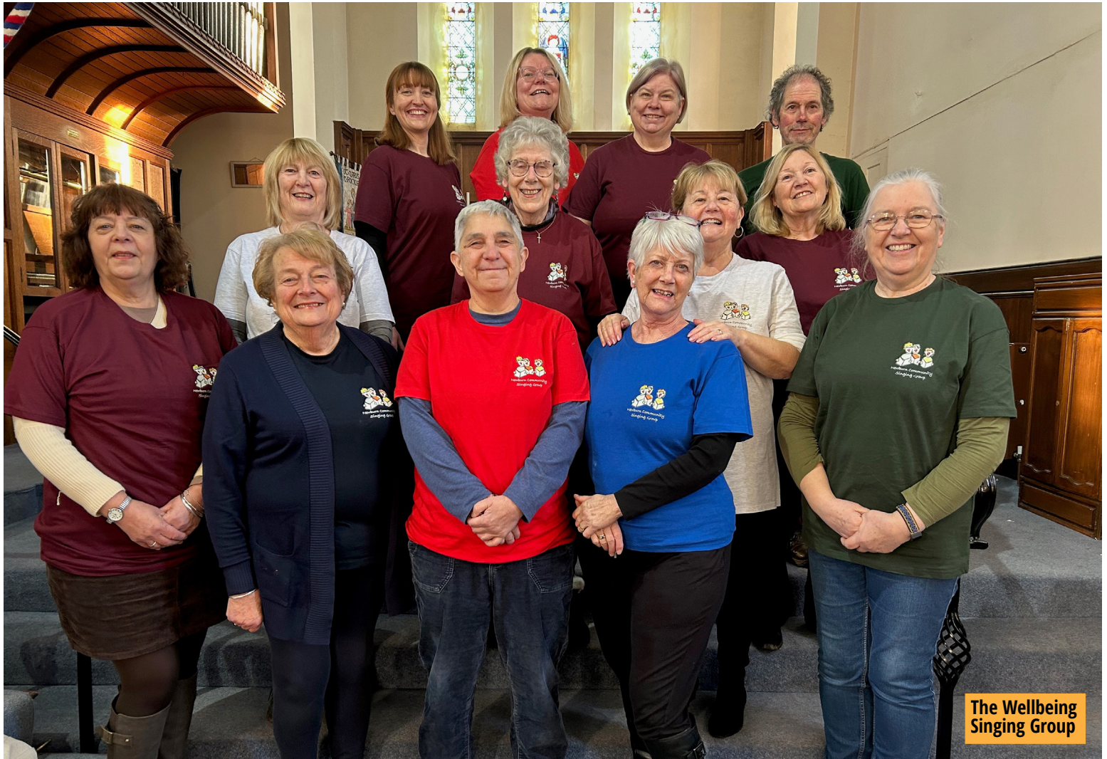
The Wellbeing Singing Group

A singing group that focuses on well-being has gone from strength to strength over the past year and is building new relationships between a church and its community.