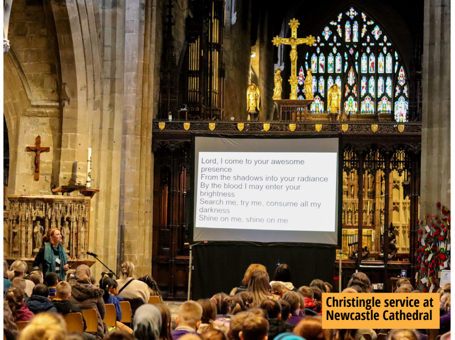
Christingle service at Newcastle Cathedral