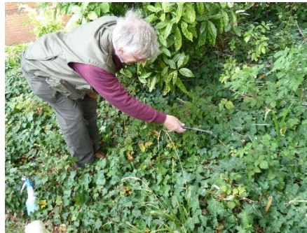
A garden spider is coaxed out

His electric toothbrush was demonstrated on a garden spider's web, and, hey presto, one appeared in the centre of the web. Our children experimented with his toothbrush and one coaxed the noble false widow out of its lair in a crack in the wall. A demonstration of the vacuum leaf extractor revealed money and sac spiders, a wolf spider and a nursery web spider.