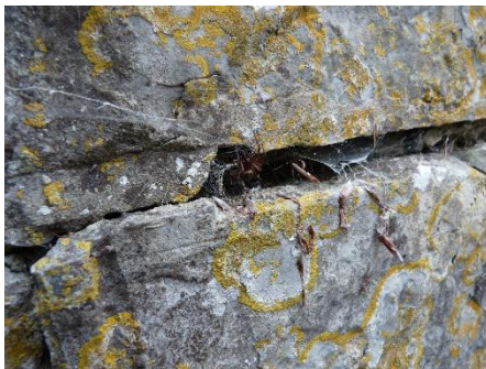
The noble false widow spider

His electric toothbrush was demonstrated on a garden spider's web, and, hey presto, one appeared in the centre of the web. Our children experimented with his toothbrush and one coaxed the noble false widow out of its lair in a crack in the wall. A demonstration of the vacuum leaf extractor revealed money and sac spiders, a wolf spider and a nursery web spider.