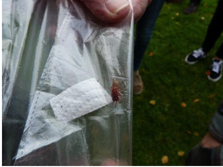
The amazing red woodlouse spider

Francis explained that the money spider was unusual because it operates underneath its web when it catches prey. Finally, a woodlouse spider was unearthed beneath a flat piece of stone where it was resting in its dense web before the night hunt.