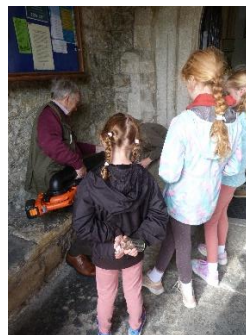
Inspecting the contents of the vacuum sweeper