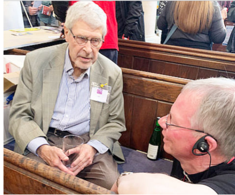
'Man of God at the feet of the Man of Beer'