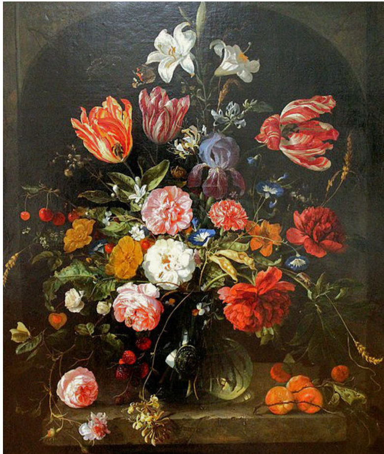
Jan Davidsz de Heem