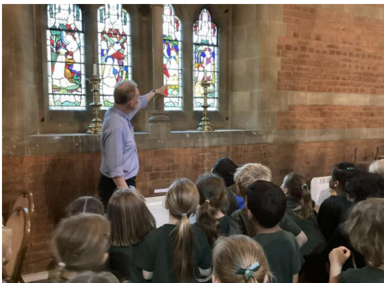
Reception class (aged 4-5) from Holy Trinity Primary School visit the church.

and every person shown the love of Christ through our care, comfort and compassion.