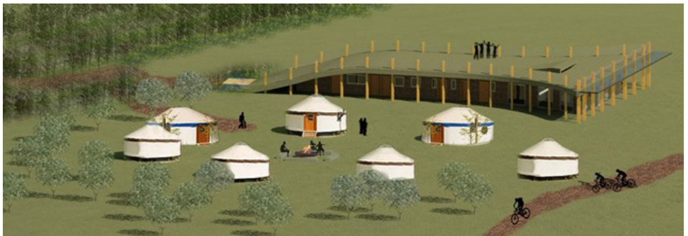
Architects image of how the new Yurt Village and Communal Hub will look. Our thanks to MEB Design for the image.

2017 has been a season of Evaluation, Consultation and Planning as we prepare to create this unique centre that will double the number of children and young people A+ can reach each year. We are now working on the overall site layout and preparing to lay the groundwork for the AdventureBase; the work will unfold across a number of phases, and our top priority is to be able to open the doors of a brand new Yurt Village enabling young people to stay on site, and become part of the adventure.