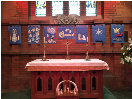
The banners were featured in December's LINK!