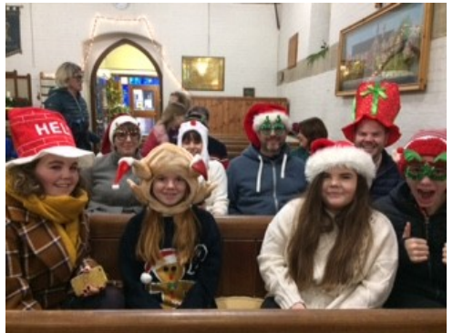
A festive family at All Saints'

Of course none of the above 'just happens', so a massive THANK YOU goes to our impressively large group of volunteers - carol singers, musicians, 'techies', church decorators, welcomers, sidesmen, food and drink providers, child carers, lift givers, etc, etc - all in all a wonderful team effort. In the relative calm and tranquillity that has followed all this activity, it has been a delight to welcome newcomers to Sunday worship and we look forward to further fellowship with them in 2020.