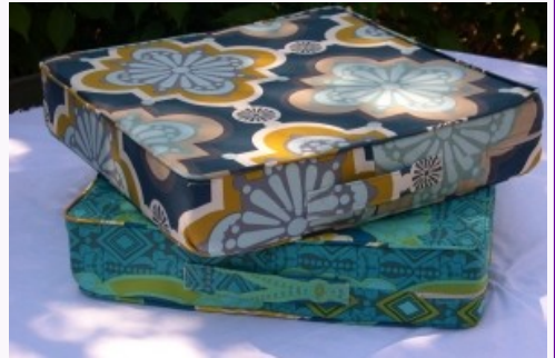
Maybe something like this?

"The battery operated cushions were developed by a Dutch inventor and cost about £100 each. They produce heating for up to four hours and members of the congregation are able to adjust the temperature."