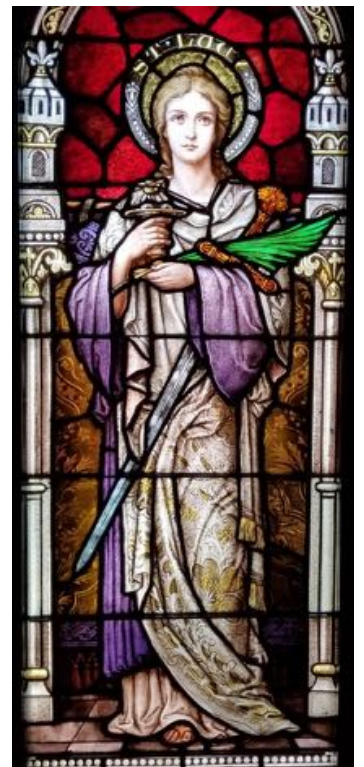
St Mary's Basilica, Phoenix, Arizona

The legend of Lucy Lucy is said to have been the daughter of a rich nobleman who died when she was young. Her mother, not a Christian, wanted to arrange a marriage between Lucy and a rich Pagan man. Lucy had committed her life to Christ and pledged to remain a virgin. She wished to spend the money intended for her dowry on alms for the poor. Lucy travelled with her mother to the tomb of Saint Agatha. As they prayed at the tomb, Lucy saw a vision of Saint Agatha and her mother's longstanding illness was miraculously cured as Lucy had hoped it would be. Lucy's mother converted to Christianity. Lucy was then able to spend her money helping the poor, but her intended bridegroom was not pleased and denounced her to the Roman governor as a Christian.