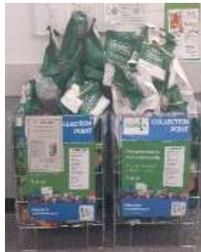
Morrisons STIRCHLEY donation point

B30 FOODBANK Cotteridge Church, 24 Pershore Road South info@b30foodbank.org.uk 07582 143972 information and clients 07985 629201 collection foodbank Redemption Media and then open B30