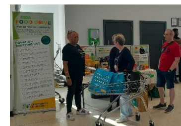
Asda Food Drive last Saturday