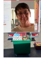
Irene on line

Last week we received in donations 1731k we gave out 2364k feeding 234 people on 116 vouchers