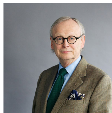
The Rt. Hon John Gummer, Lord Deben, Chairman of the Committee on Climate Change www.theccc.org.uk/author/ lord-deben