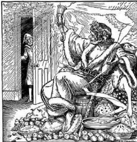
Scrooge meeting the 'Ghost of Christmas Present.'