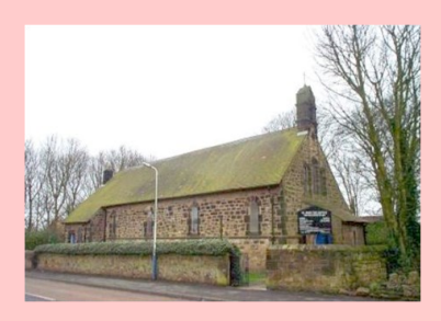
St. John's Backworth