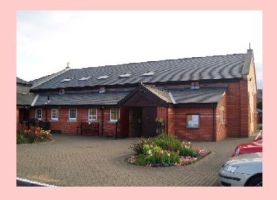
Immaculate Heart of Mary, Parish of Our Lady Star of the Sea