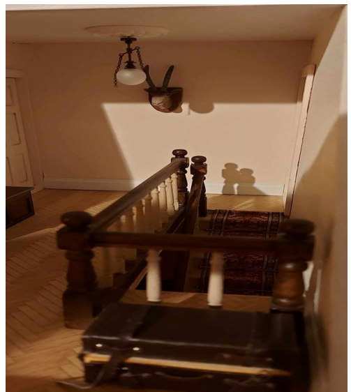
Next time - the Smoking Room.

The hall/landing contains a trunk and a deer's head on the wall.