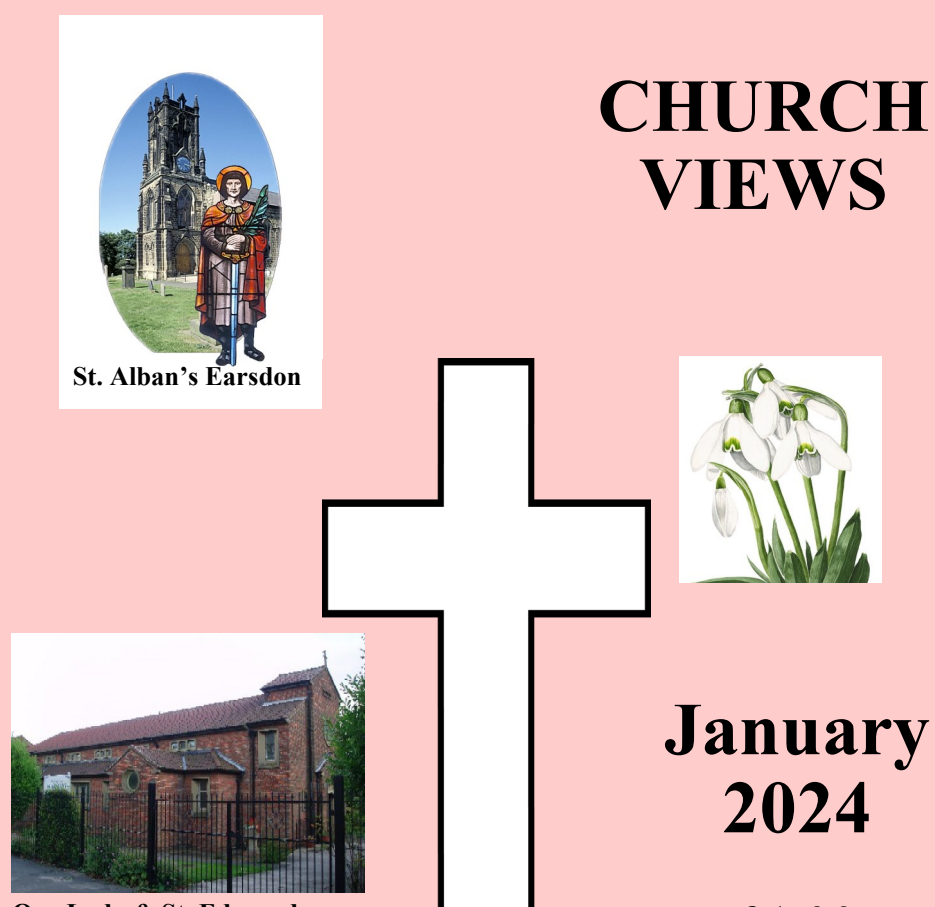
Our Lady & St. Edmund, Parish of Our Lady Star of the Sea