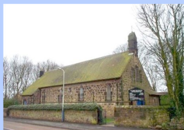
St. John's Backworth