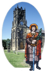
St. Alban's Earsdon