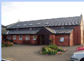
Immaculate Heart of Mary, Parish of Our Lady Star of the Sea