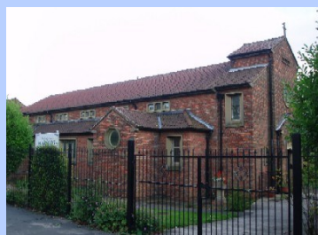
Our Lady & St. Edmund, Parish of Our Lady Star of the Sea