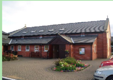
Immaculate Heart of Mary