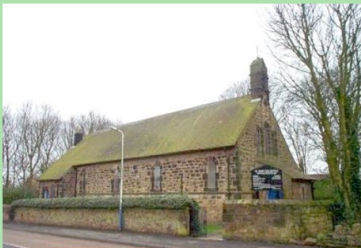
St. John's Backworth