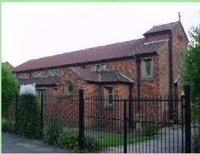
Our Lady & St. Edmund