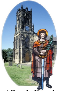
St. Alban's Earsdon