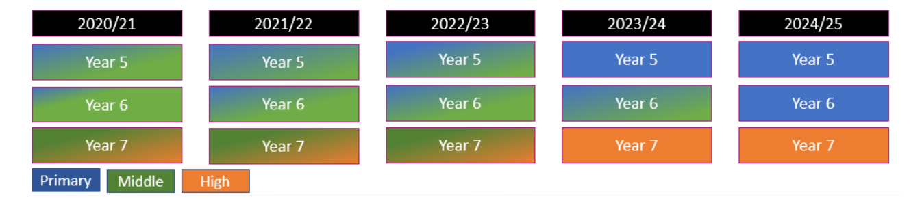
Option 1: Transition in line with natural progression, coordinated age range changes and coordinated accommodation changes. All changes made by September 2024.

There are three options to manage the proposed changes: