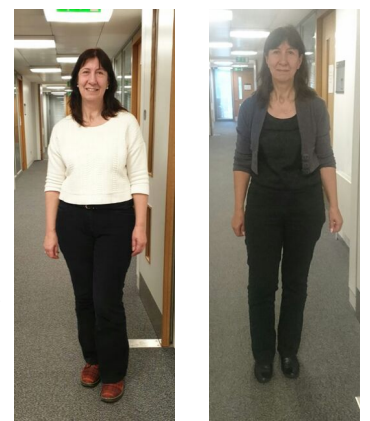
Before and after photos