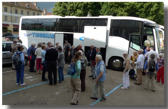
Holiday in Burgundy