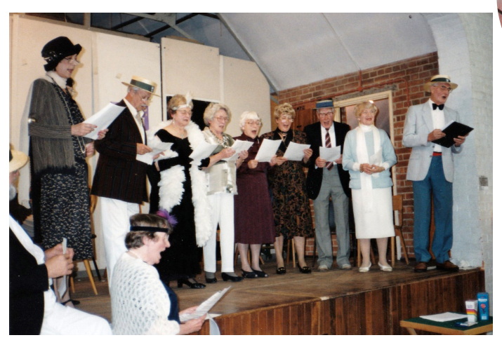
20 s/90 s party to celebrate 75 years since laying the 1919 foundation stone

In 2002, in a move to get the laity more involved in leadership, a Social Department was created. Over the years, its activities have included fish and chip suppers; quiz nights; showings of films put together by the Video Club, many of whose members were part of St Michael's. There were guided walks for those who wanted to do something more active, reviving an earlier tradition. There were also a series of pantomimes and variety shows at which some members of the congregation revealed hidden talents!