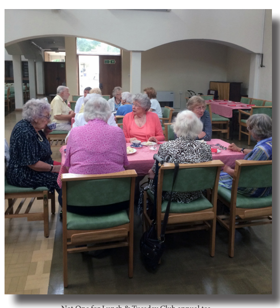
Not One for Lunch & Tuesday Club annual tea