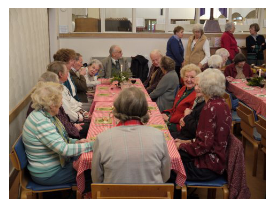
Not One for Lunch