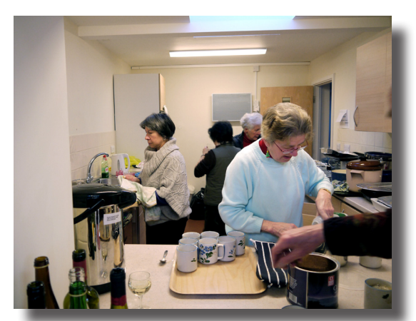
Not One for Christmas Lunch helpers