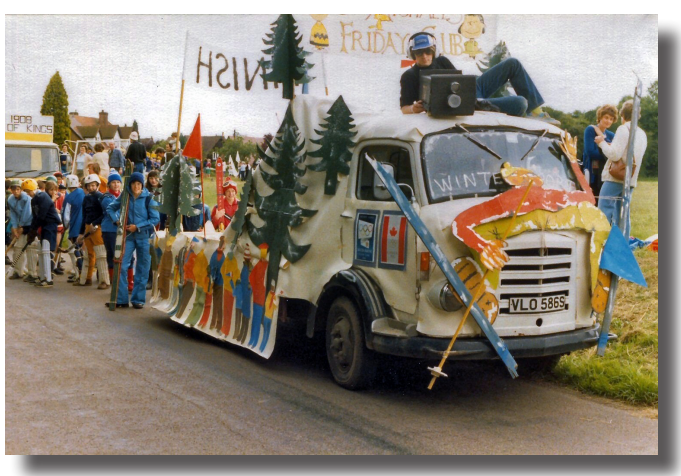
Friday Club at the Carnival