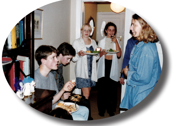
Youth Group Progressive Supper