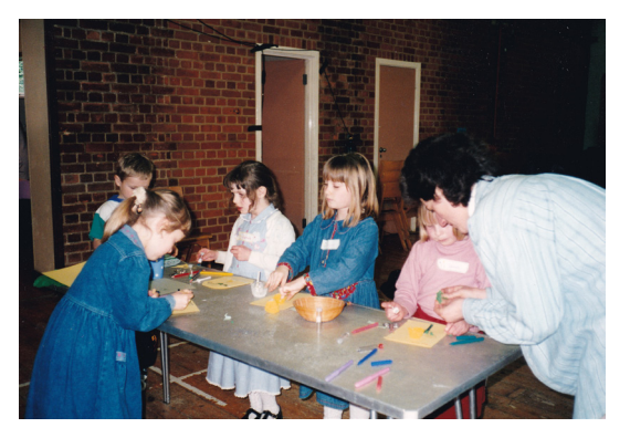
Sunday School in the Hall