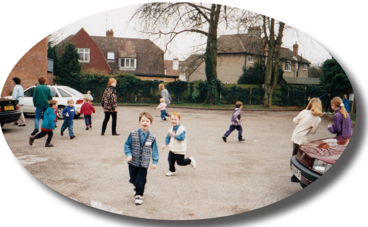
Sunday School children in the car park

The number of families with children attending St Michael's meant that it had a thriving Sunday School with between 60 and 70 on the role in 1978. For older children, Sunday at 10 provided an opportunity for discussion while their parents were in church, and social activities such as theatre trips.