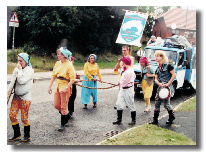
Youth Group at the Carnival

The Clubs aimed to provide an environment where young people could grow in confidence and respect for themselves and others. Its success in achieving this can be seen in the way it grew its own leaders, and expanded its activities into the wider community such as running an annual party for senior citizens which regularly attracted 100 guests.