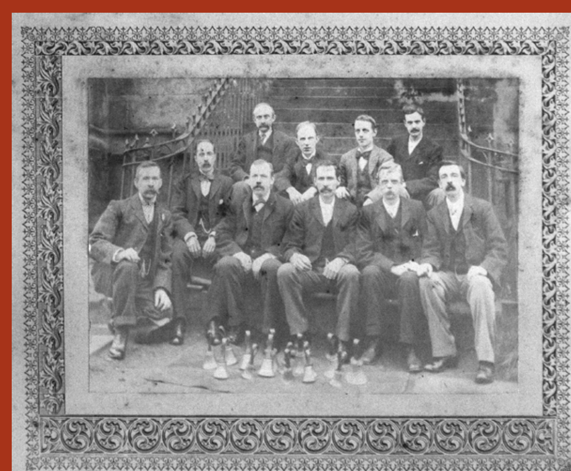
This photograph of Bradford's bell ringers hangs in the ringing chamber. Notice the peal of hand bells which would have been used for competitions and practise.