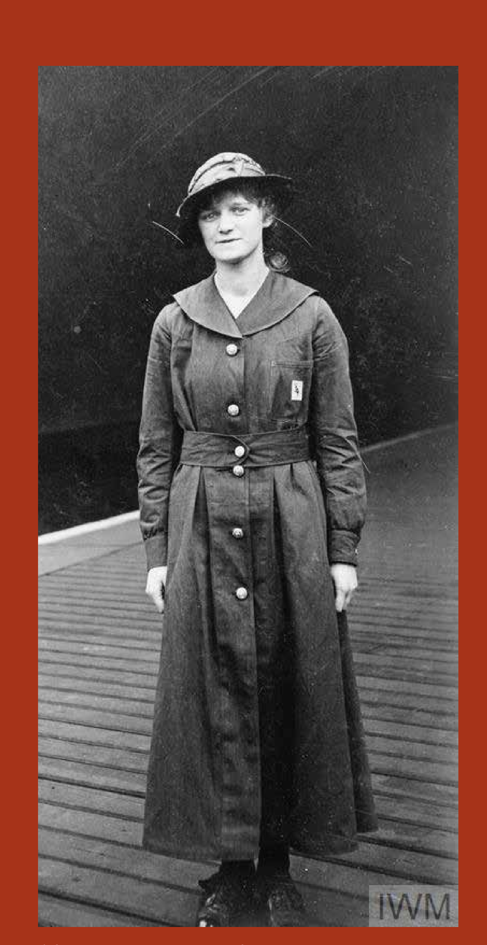
A female club carriage attendant of the Lancashire and Yorkshire Railway during the war.

The Women's International League for Peace and Freedom was established in 1915 and met initially in The Hague. Their desire for peace did not meet with universal approval. The Bradford Women's Humanity League evolved from this movement. It was formed ten days after conscription was introduced in 1916 and held many anti-war meetings. In September 1917, 3,000 women took part in an anti-war demonstration, marching across the City from the Textile Hall on Westgate and ending near Bradford College. They were accompanied by a band and carried banners bearing slogans such as: "The Boys in the Trenches want Peace" and "I want my Daddy."