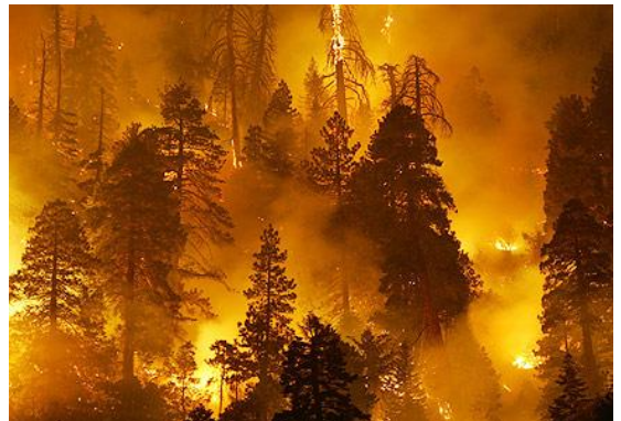
The Fire of Jeremiah

God promises a judgement by fire in the End Times. “And I will send a fire on Magog, and among them that dwell carelessly in the isles: and they shall know that I am the LORD ” Ezekiel 39:6.