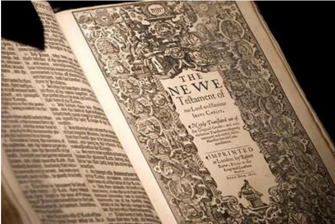
“The Royal Law” James 2:8