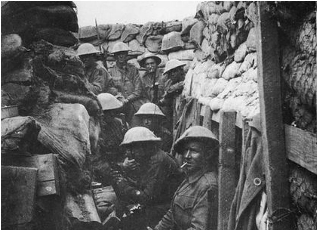
Australians in the trenches at Fromelles July 19 th 1916 4 Only three of the men pictured survived the battle; all three were wounded 5