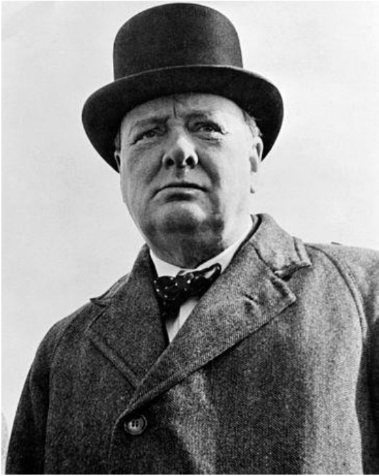
The Right Honourable Sir Winston Churchill KG, OM, CH, TD, DL, FRS, RA

“Then did I beat them small as the dust before the wind”