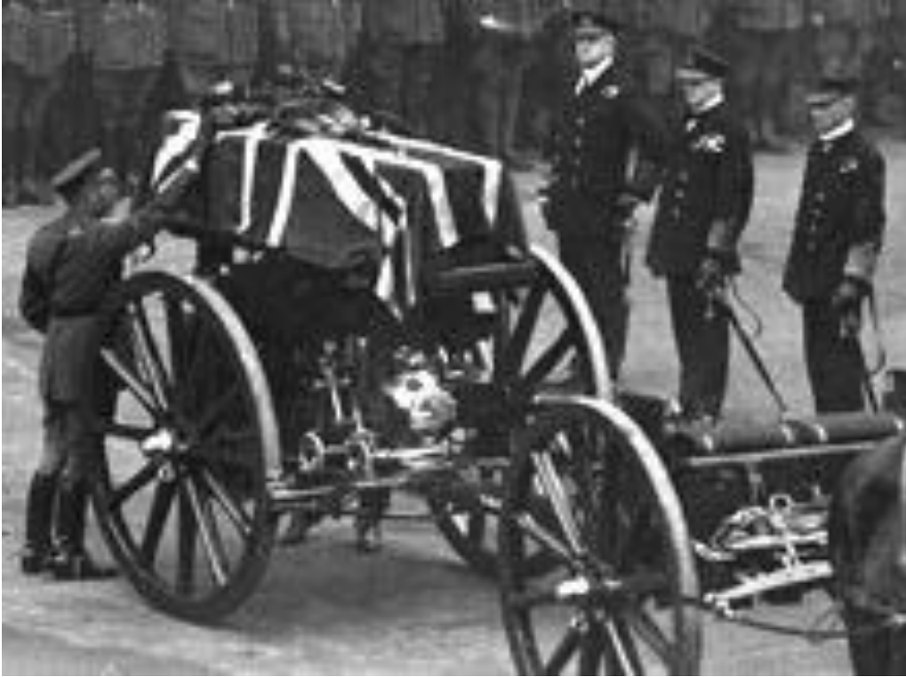
11 th November 1920: King George V placing a wreath on the coffin of the Unknown Warrior 1