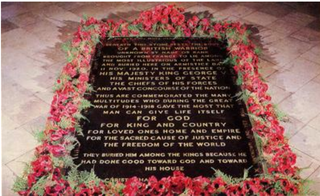
The Tomb of the Unknown Warrior in Westminster Abbey 2

And they buried him in the city of David among the kings, because he had done good in Israel, both toward God, and toward his house