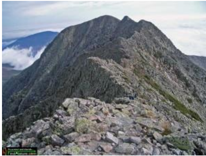
The Greatest Mountain